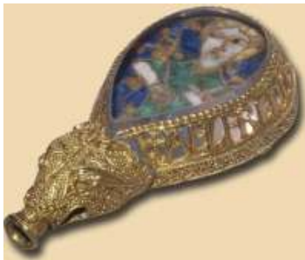
AELFRED MEC HEHT GEWYRCAN