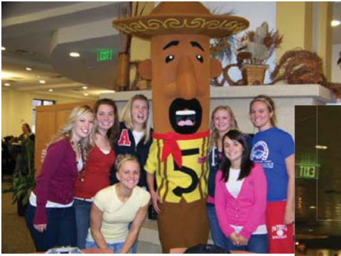
Klements Racing Sausages Dash Through Dining Services